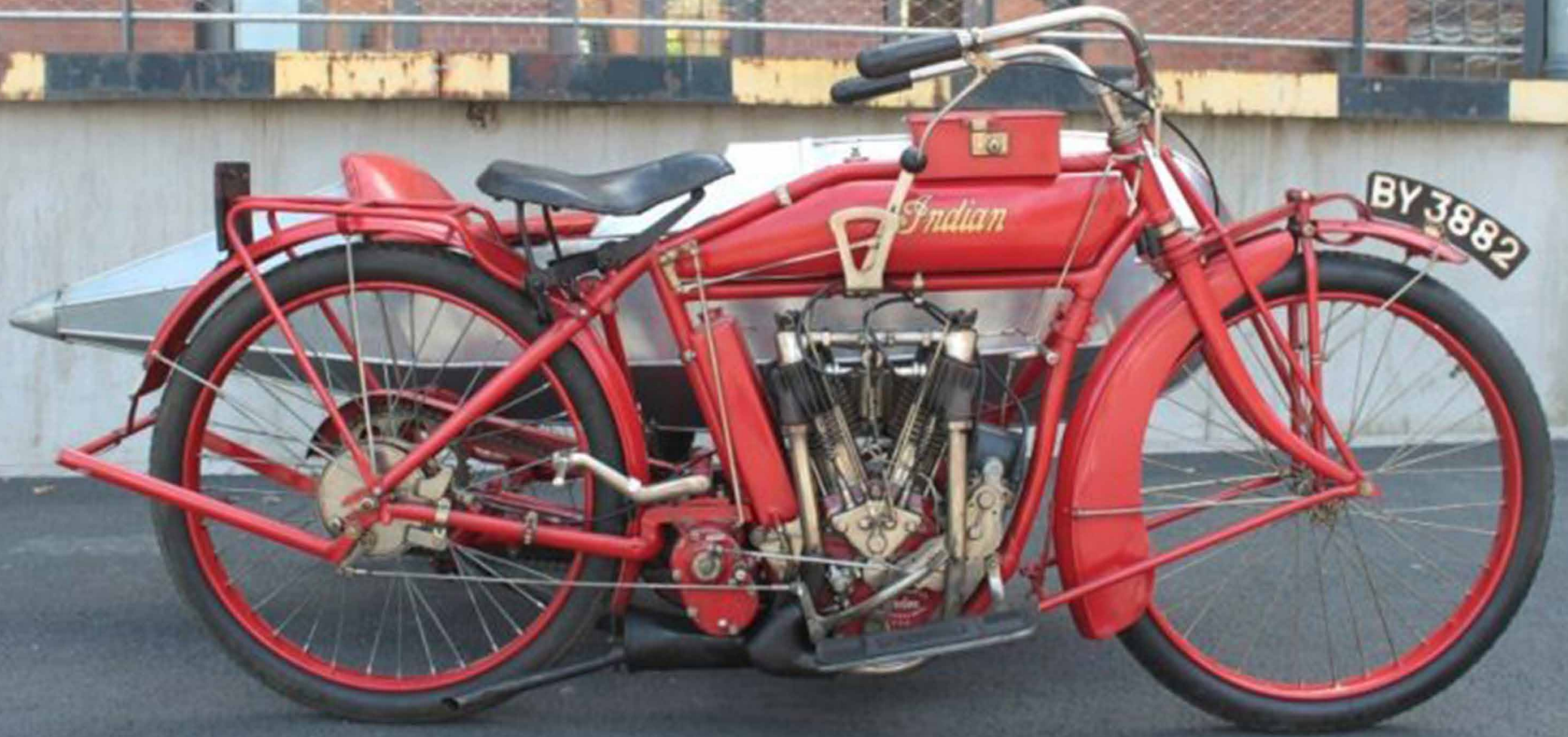
1915 INDIAN G LITTLE TWIN WITH SIDECAR